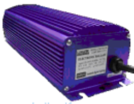
Lumatek ballast 30% more light