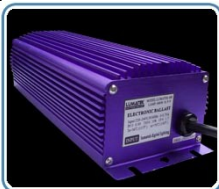
Control box or ballast