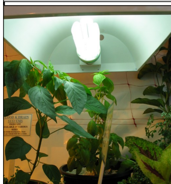
130Watt Fluoros are a recent development in grow lighting