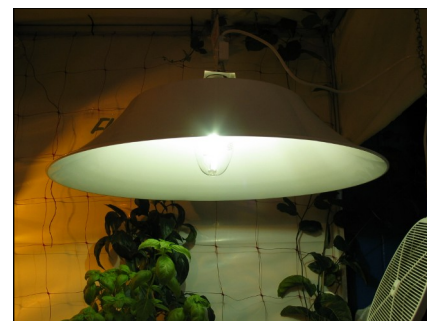
Metal Halide lighting

Lamp differences include amounts of red, light output, reliability, and thermal output (heat) We recommend the 1000W Supergro grow and flowering lamp for 1000W Metal Halide users.