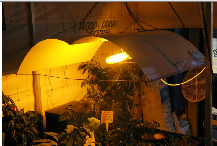
Growing under lights is a popular hobby

to Hydrocentre's Hydroponic Gardening guide Please read this supplement first if growing indoors