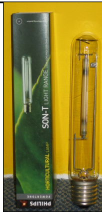
Son T Agro 400W

It is very important if you want good results to make your grow room light tight. No light getting in or out. Strangely enough, light getting into a grow room when the light is off