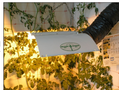
High Pressure Sodium (HPS) have an orange colour

High Pressure Sodium (HPS) lighting runs off a HPS ballast (a type of transformer) and needs a specialized lampholder and reflector to run the lamp. They output light mostly in reds and orange bands, and have sufficient blue added to keep a plant happy if the lamp was designed for horticulture. (Avoid street lamps) Lamp differences include amounts of blue, light output, reliability, and thermal output (heat). Our most recommended would be the General Electric Lucagro in 400, 600 and 1000Watt sizes, we also carry Phillips 400Watt Son T Agro.