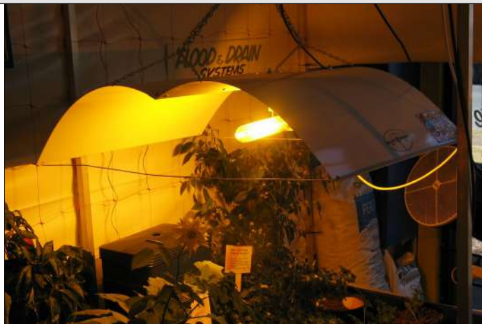
Growing under lights is a popular hobby

to Hydrocentre's Hydroponic Gardening guide Please read this supplement first if growing indoors