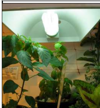
130Watt Fluoros are a recent development in grow lighting