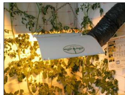
High Pressure Sodium (HPS) have an orange colour

High Pressure Sodium (HPS) lighting runs off a HPS ballast (a type of transformer) and needs a specialized lampholder and reflector to run the lamp. They output light mostly in reds and orange bands, and have sufficient blue added to keep a plant happy if the lamp was designed for horticulture. (Avoid street lamps) Lamp differences include amounts of blue, light output, reliability, and thermal output (heat). Our most recommended would be the General Electric Lucagro in 400, 600 and 1000Watt sizes, we also carry Phillips 400Watt Son T Agro.