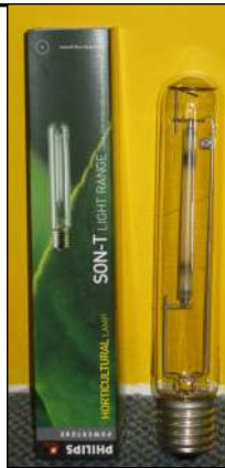
Son T Agro 400W

It is very important if you want good results to make your grow room light tight. No light getting in or out. Strangely enough, light getting into a grow room when the light is off