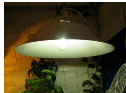
Metal Halide lighting

Lamp differences include amounts of red, light output, reliability, and thermal output (heat) We recommend the 1000W Supergro grow and flowering lamp for 1000W Metal Halide users.