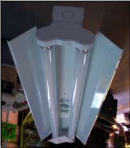
2foot fluoro twin lamp

Used for Cuttings, Seedlings and under lighting 2ft fluoro twin lamp batten with reflector available $65 + lamps 2ft cool white propagation lamps $4.5 each 2ft GROLUX Propagation and Grow lamps $12 each 4ft cool white propagation lamps $5 ea 4ft GROLUX Propagation and Grow lamps $19.50 each