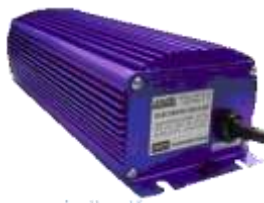
Lumatek ballast 30% more light