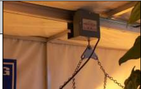
Left: Jupiter Rail light mover

Light movers move the lights above the plants to enhance yield by bringing the light closer, shining light into undergrowth, and increasing the growing area.