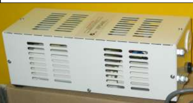
Control box or ballast

Remember side-lighting can always assist plants to grow higher. The reflector design varies depending on the height of the plants and the area